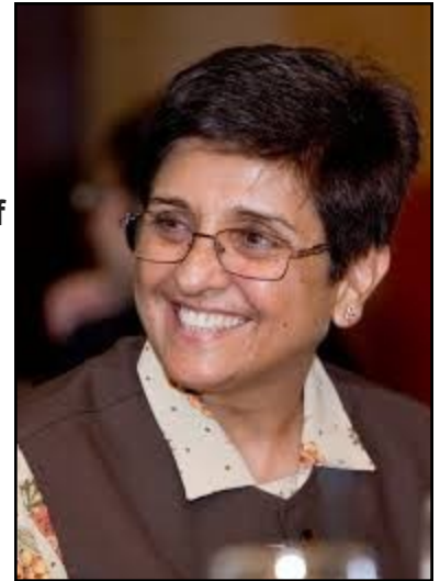
Dr. Kiran Bedi